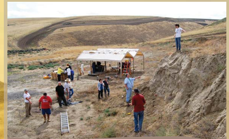
Training and scientific excavation begins, September 2010

The Coyote Canyon Mammoth Site provides a unique outdoor classroom and laboratory and an important window into the region's Ice Age past. The site contains an extended paleoenvironmental record of the geology, botany, and zoology in the eastern Washington region. Carefully controlled excavation by students and teachers is helping to document the area's Ice Age history for the first time.