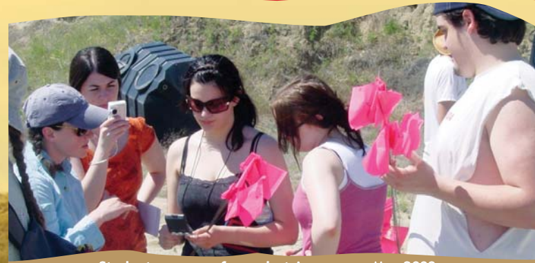
Students prepare for pedestrian survey, May 2008