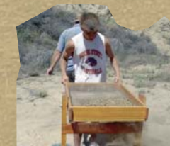
Dry screening, May 2008

Among the most prolific fossils in the state, are those of the Columbian Mammoth, the official fossil of Washington State. However, few of these finds have been excavated and studied to the exacting scientific standards that modern paleontology and archaeology disciplines require.