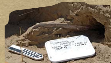
Rib found during exploratory excavation, May 2008

The last major Ice Age was a time of massive continental glaciers, giant mammals, early humans, and the world's largest fresh water floods (the cataclysmic Missoula Floods, that extended from eastern Montana through Idaho, Washington, and Oregon). It ended with the extinction of nearly all giant mammals in North America.