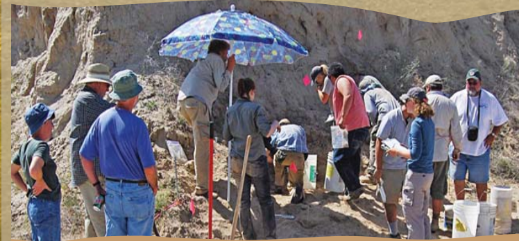
Exploratory excavation, May 2008

Soliciting local businesses for donations for equipment and materials for the excavation has developed community support. Local educators, organizations, and private individuals are being recruited and trained to mentor students who participate in the dig. The goal is for experienced students to help train those new to the program in an ongoing cycle. Workshops have been held for educators and other community volunteers.