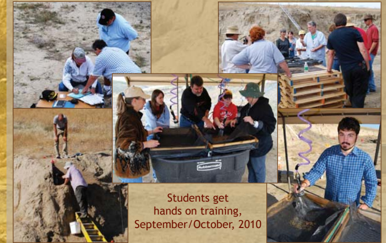
Students get hands on training, September/October, 2010

The Coyote Canyon Mammoth Site provides a unique outdoor classroom and laboratory and an important window into the region's Ice Age past. The site contains an extended paleoenvironmental record of the geology, botany, and zoology in the eastern Washington region. Carefully controlled excavation by students and teachers is helping to document the area's Ice Age history for the first time.